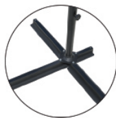
Cross base Base cruzada